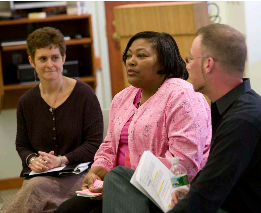
Schwartz Center Rounds session at Winchester Hospital, Winchester, MA