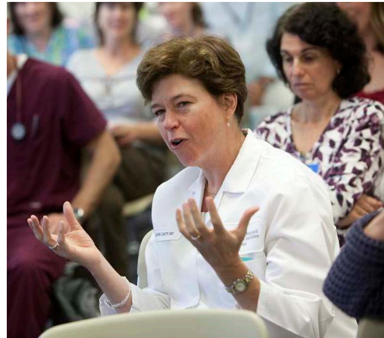
Schwartz Center Rounds session at Harvard Vanguard Medical Associates, Cambridge, MA